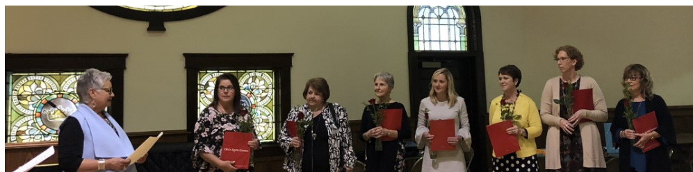
New chapter members participate in Induction ceremony