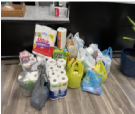
Our collection of donations for the Shepherd's House. THANK YOU!